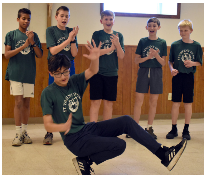
The Flora PE class learned the Ukrainian Hopak dance during the winter.