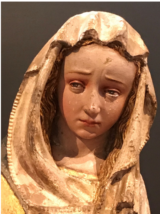
Virgin of Sorrows, 15th century Valladolid, Spain