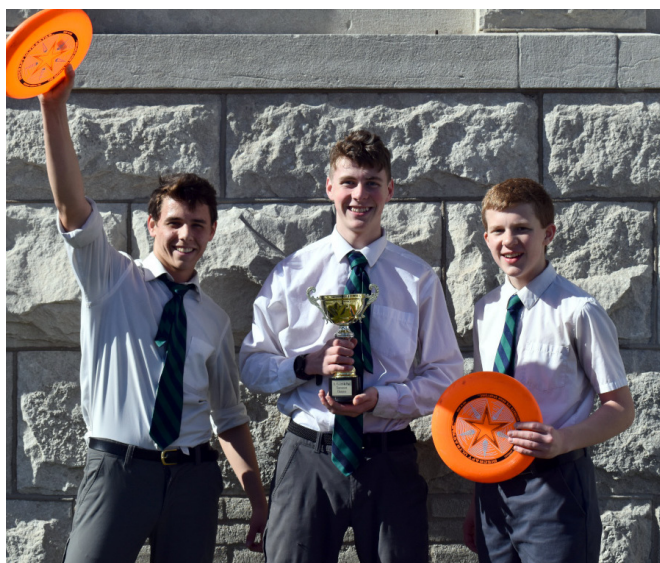
The Forty Holy Martyrs Intramural Ultimate Frisbee Tournament was won by The Pups.